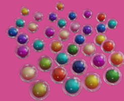
SINGULAR AMINO ACIDS