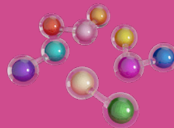
DI AND TRI-PEPTIDES